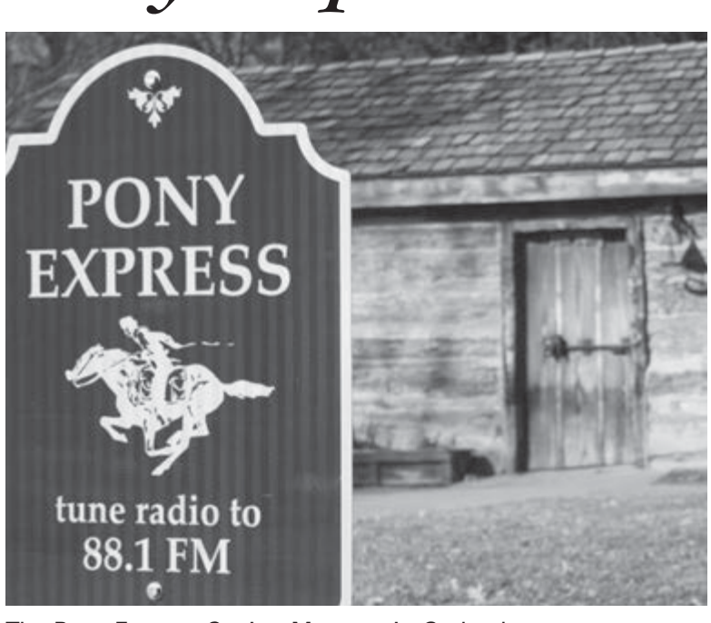
The Pony Express Station Museum in Gothenburg now presents information via sound. Visitors may tune in to FM 88.1 on the radio to learn additional information.

The original Pony Express Station Museum located in Gothenburg — the Pony Express Capital of Nebraska — has added a new feature for motorists who visit when traveling through the state: History of the Pony Express delivery service at the speed of sound via their vehicle radio. Visitors now have the ability to tune in to an FM broadcast anytime they're near the museum and hear a familiar western voice greet them with information about the Pony Express and its place in American The station is located in a